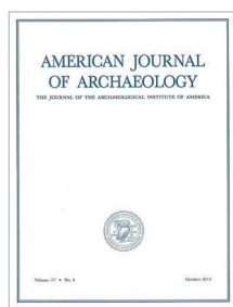
October 2013, 117.4