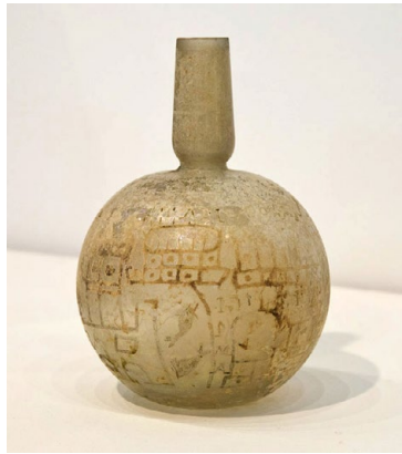
FIG. 1. The Pilkington flask. St. Helens, England, World of Glass, inv. no. SAHGM.1974.002.

Unless otherwise noted in the caption, images are by the author. Images are not edited by the AJA to the same level as those in the published article.