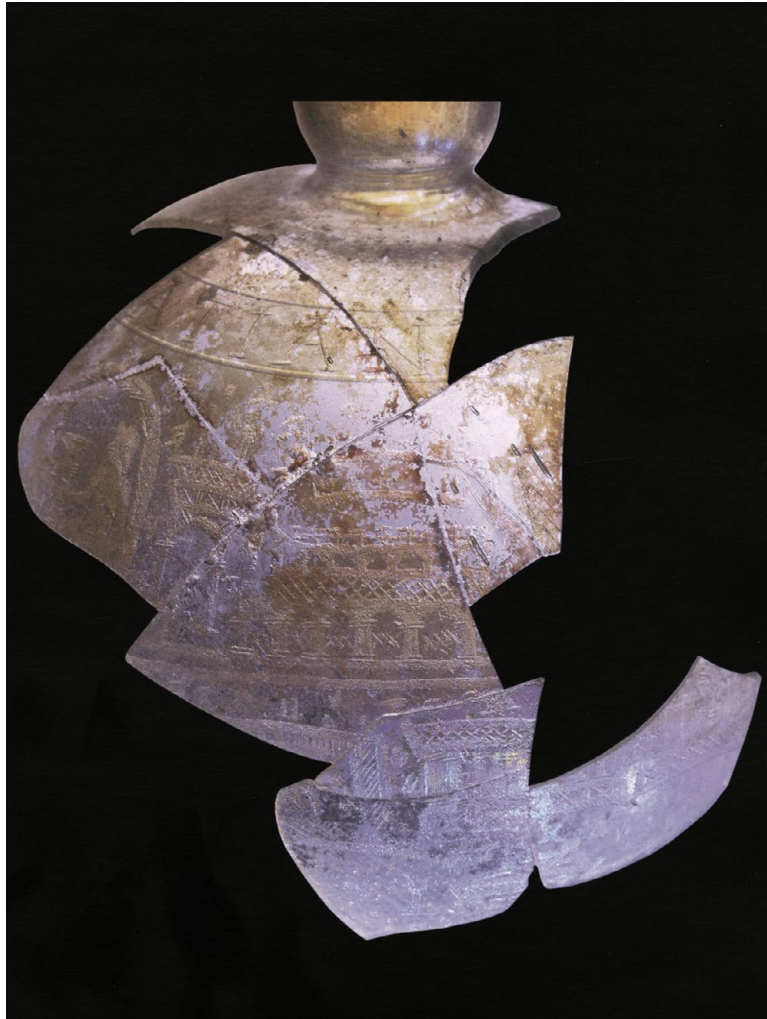
FIG. 4. The Brescia flask (Roffia 2002, pl. 5).