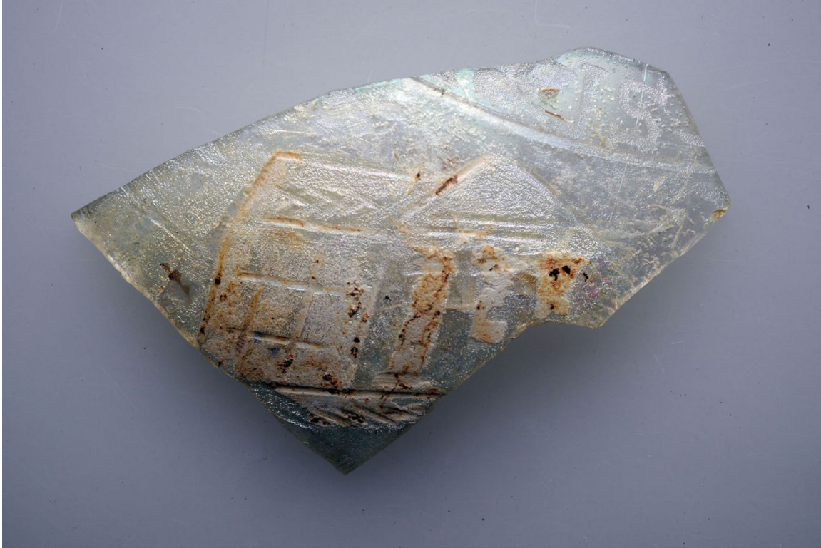
FIG. 5. The Casteggio fragment.