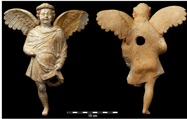
FIG. 1. The Eros terracotta figurine from Tel Kedesh, front and back views.

Unless otherwise noted in the caption, images are by the author. Images are not edited by the AJA to the same level as those in the published article.