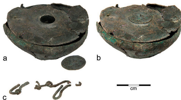
FIG. 3. Parts of a bronze inkwell from Tel Kedesh: a , bowl with small cover removed; b , bowl with small cover in place; c , fragments of a chain that probably once stretched across the top of the lid (P. Lanyi; courtesy Sharon Herbert and Andrea Berlin, Tel Kedesh Excavations).