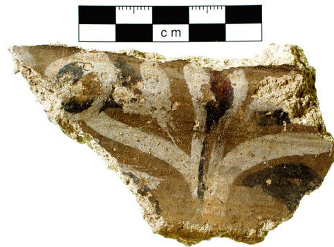
Fig. 5. Pattern band, Lesbian cymation, cat. no. 20 (S. Morton).