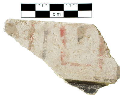
Fig. 9. Pattern band, geometric A, cat. no. 50 (S. Morton).

Context: Trench 150/3, stratum 7.3; plaster deposit just above Floor 2 in southwest quadrant.