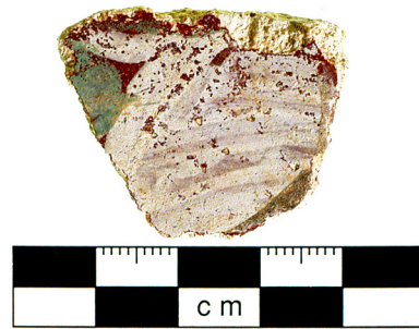
Fig. 4. Goat rump in front of chariot, cat. no. 15 (J. Travis).

Description: On a yellow background, a worn oculus appears at the top of a pattern band. White arcs, under-shaded in dark yellow, branch from the pattern band, and a black and gray shape appears at the base. Above the pattern band is a deep groove, then a solid red—the base of the frieze.