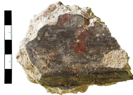
Fig. 11. Black panel with floral design?, cat. no. 63 (S. Morton).

Context: Balk D1.4; Floor 2 in northwest quadrant.