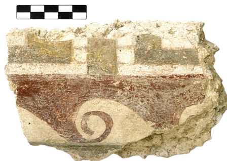
Fig. 8. Pattern bands, wave below geometric B, cat. no. 47 (B. Douglas).