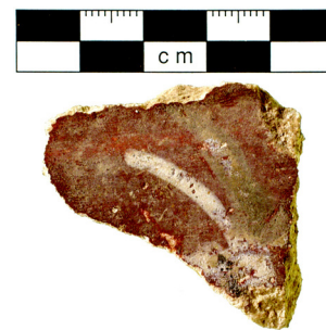
Fig. 2. Goat horns, cat. no. 8 (S. Morton).