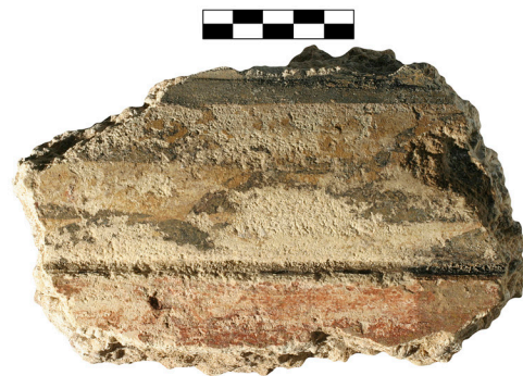
Fig. 10. Pattern band, chain pattern, cat. no. 59 (R. Miller).