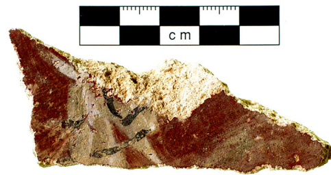
Fig. 1. Goat head, cat. no. 7 (S. Morton).

Dimensions: Max. preserved ht. 13.0 cm; max. preserved width. 12.2 cm.