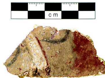
Fig. 3. Goat pair, chests, cat. no. 9 (S. Morton).

Description: A fragment linking the figured frieze with the decorative floral band below it, separating the two with a simple ridge molding. The upper part of the fragment shows only the chest and forelegs of a goat pair and faint traces of a chariot wheel to the viewer's left (goat pairs in other fragments move to the viewer's right, prancing or rearing). Only the upper bodies (i.e., the chests of the goats) are preserved, wearing the black breastbands. On