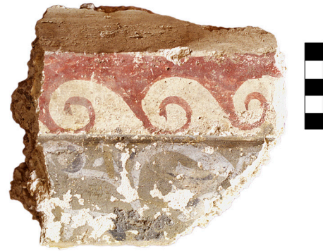
Fig. 7. Pattern bands, wave above garland pattern, cat. no. 43 (J. Travis).

Description: Band of wave pattern, white on red, separated by a deep groove from a wider band of floral/vegetal motifs of which the full pattern is unknown. The background color is yellow-green/gray, and the foliage, if it is such, has pale gray leaves with darker gray shadings. Above the wave band, a step (wdth. 3.0 cm) slopes toward the wall, implying the finished top of the pattern band. The garland